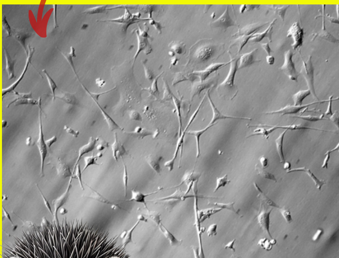
Corneal Endothelial Cells